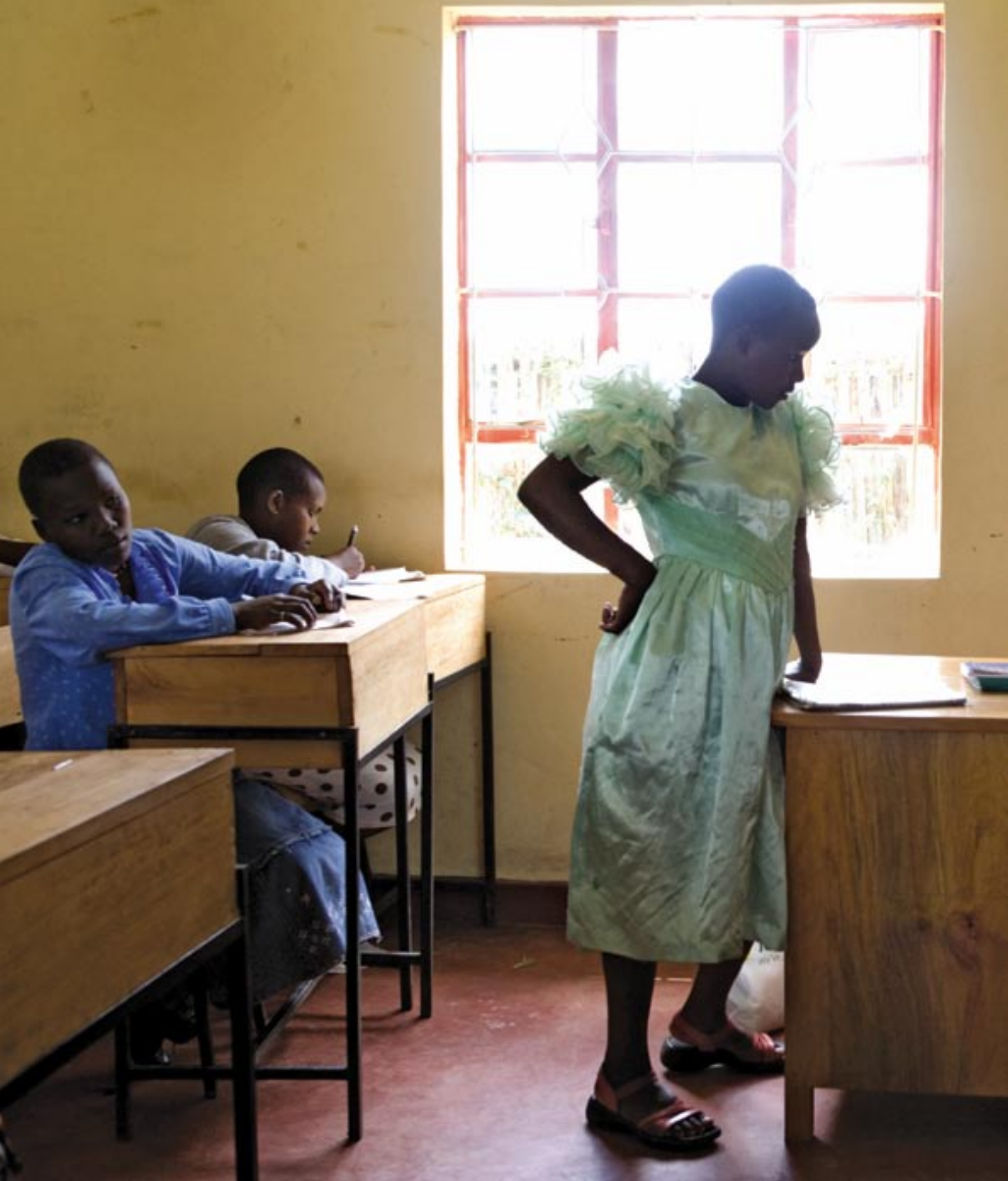
A school teacher reviews student work in Narok, Kenya