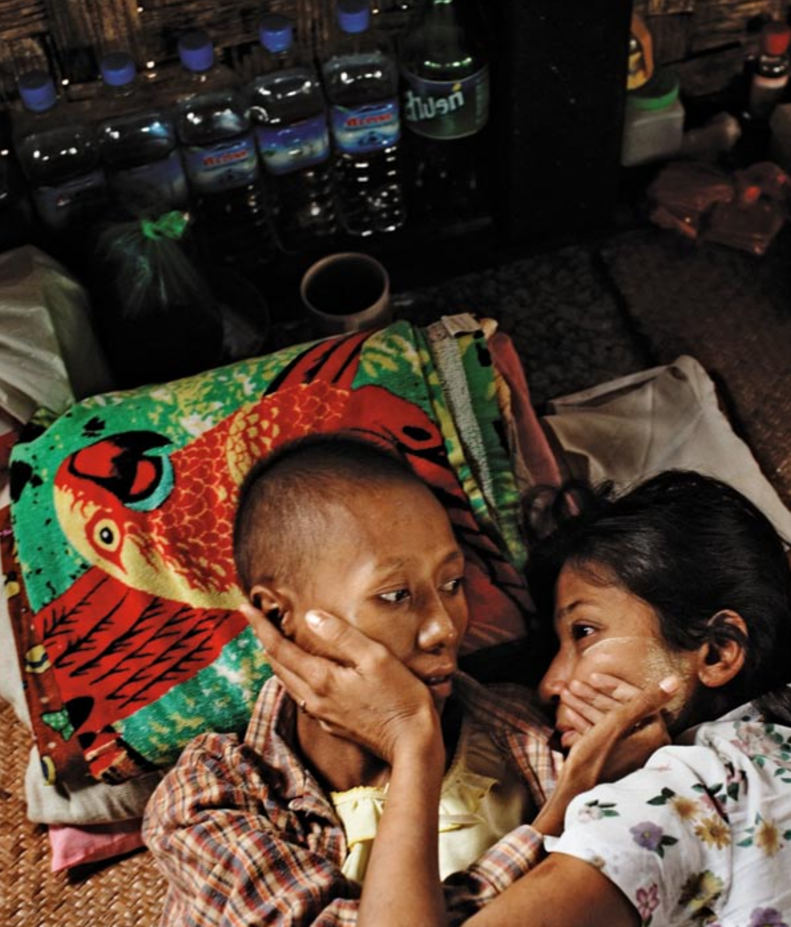
HIV-positive patients at temporary treatment shelter in Rangoon, Burma