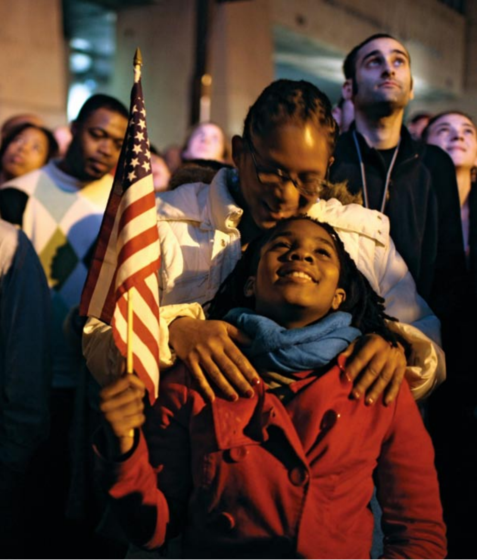
Crowd watching U.S. presidential election returns in New York