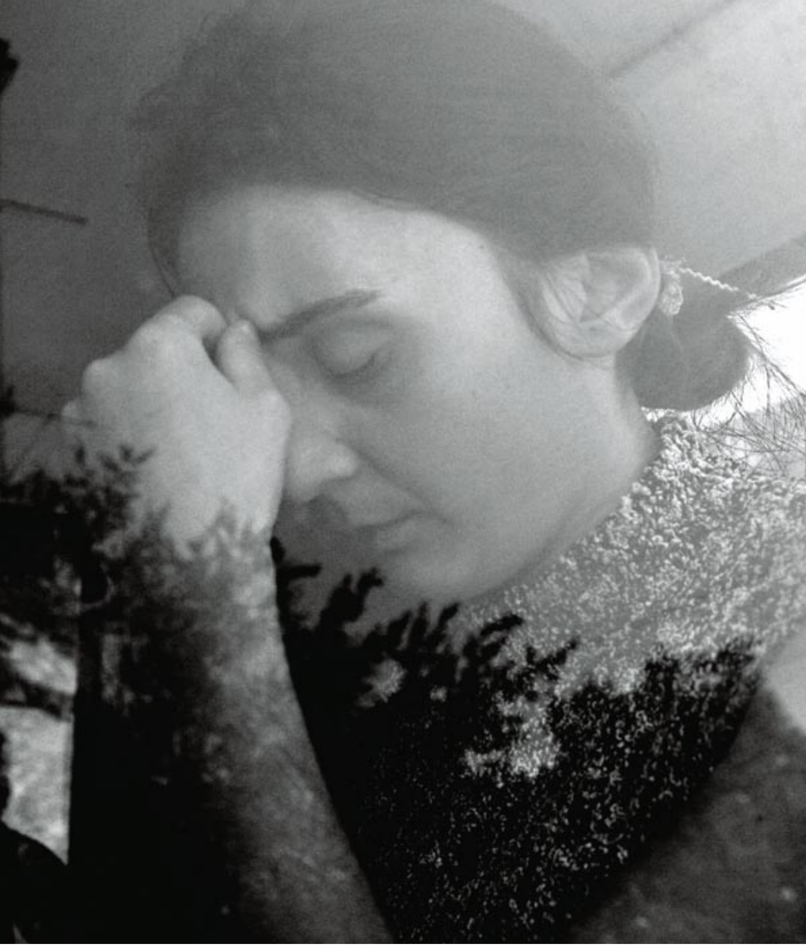
A woman displaced by fighting in Gori, Georgia